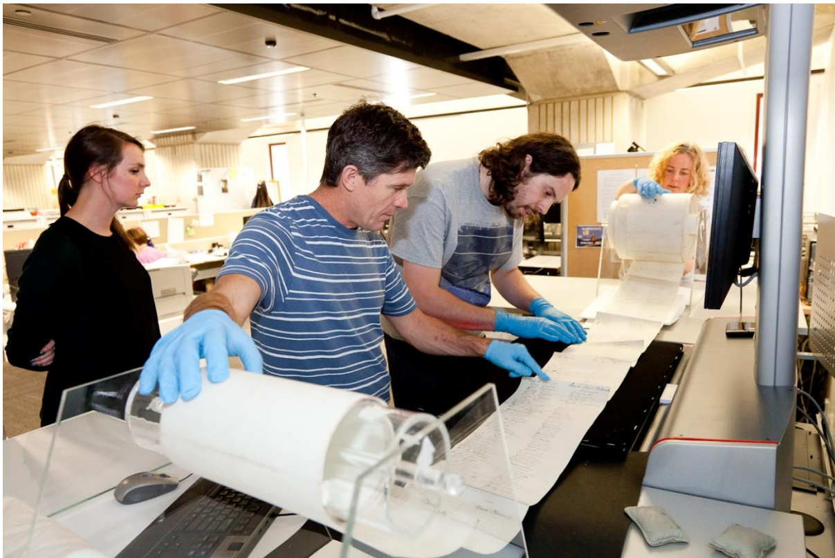
Digitising the 1893 suffrage roll (Te Ara).

In 2011 Archives New Zealand re-digitised the main 1893 suffrage petition at a much higher resolution. One useful result of this work was that many of the errors from the 1993 transcripts could be corrected. This correction work was done by Archives staff in preparation for adding the transcript as metadata for the Archway online search tool.