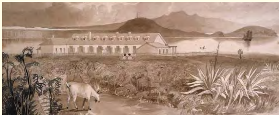
The first Government House (built in 1842, burnt 1848), Auckland, showing the North Head of Waitematā Harbour. Artist: Edward Ashworth. ATL: E-216-f-015.

More than 34 million acres of South Island land were purchased from Ngāi Tahu. The tribe later protested that reserves had not been set aside for them, boundaries of sold blocks were not where they ought to have been, prices paid for their lands had not been fair, and the promise of schools, hospitals and other benefits of European settlement had not been honoured. They found themselves poorly placed to take advantage of the new economic order. Instead, as large numbers of settlers flowed in, Ngāi Tahu became confined to just over 37,000 acres of reserves, much of it poor quality land. They were also denied access to their former food-gathering sites. Most seriously, they were left with inadequate arable and pastoral lands to enter the new economy as farmers.