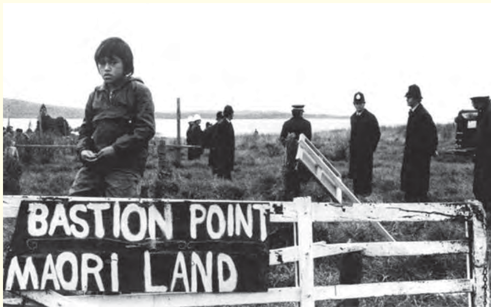
Bastion Point, 25 May 1978.

Since the 1980s successive governments have accepted the need to resolve historical Māori grievances in accordance with the terms of the Treaty of Waitangi. The Crown came to permit direct negotiations that bypassed the Waitangi Tribunal. In 1988 the Treaty of Waitangi Policy Unit (later the Office of Treaty Settlements) was established within