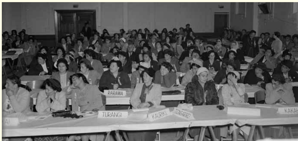
Some of the delegates at the Māori Women's Welfare League annual conference, at the Wellington Town Hall, April 1953.

Land grievances remained a sore point, however, and not only for historical reasons. The Maori Affairs Amendment Act of 1967 caused particular discontent. It brought in compulsory "improvement" of Māori lands, including the extension of provisions first introduced in 1953 for the compulsory acquisition of "uneconomic interests" in land. This ignored the fact that such lands were often the last fragments connecting their owners to their turangawaewae (place to stand, or homeland). Such policies might have been well-intentioned, but to many Māori they were outdated and paternalistic, making no allowance for cultural and spiritual links to the land.