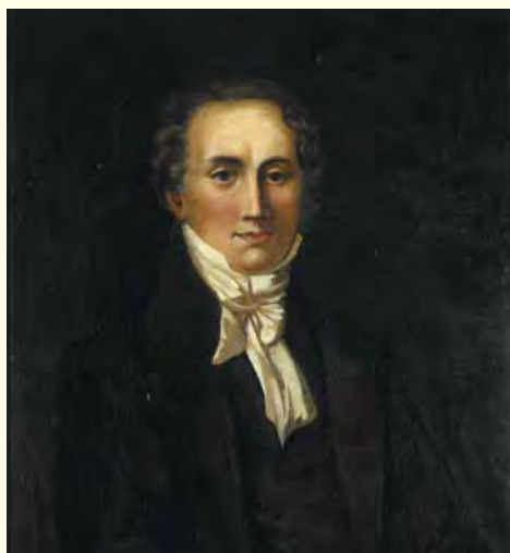
Portrait of F.E. Manning, a judge of the Native Land Court.

Not all of this land had been sold. Under the Public Works Act of 1864 and subsequent laws, Māori (and European) lands could be acquired for roads, railways and other public works, sometimes without compensation. It appears that in many instances Māori land was especially targeted for compulsory acquisition in preference to nearby Pākehā land. Roads were sometimes circuitously routed through Māori reserves. Māori also complained that land taken for schools was neither used for such purposes nor returned to them if it was not used. They also claimed that later they had to pay rates to local bodies, on which they were not represented, for services they did not receive.