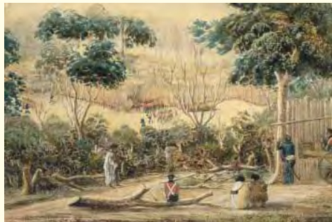
View of the pā at Ruapekapeka from the lower stockade at the time it was entered and captured by the “allied force of friendly natives and troops”, under Lt Colonel Despard, 11 January 1846. Artist: Arthur David McCormick. ATL: A-004-037.

At first, in the North Island at least, and outside the few small coastal pockets of European settlement, the extension of substantive Crown sovereignty involved negotiation and persuasion with Māori communities. Lieutenant-Governor Hobson had been provided with few finances and a tiny police and military force. When war broke out in the Bay of Islands in the mid-1840s (and subsequently elsewhere), the Crown needed to rely on the support of Māori allies to bring an end to the conflict. But after a series of intertribal conflicts in the Bay of Plenty, the Colonial Office ruled in 1843 that British law and the terms of the Treaty applied even to those chiefs and their tribes who had not signed the agreement.