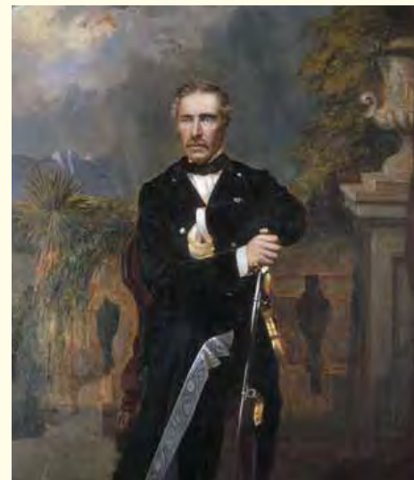
Sir George Grey.