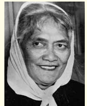
Princess Te Puea Herangi.

Even in the Waikato district, where “Princess” Te Puea Herangi had led a determined campaign against conscription of Māori men during World War I, relations with the Crown gradually improved. The government was willing to consider the long-standing grievances of the Waikato-Tainui people about the invasion and confiscation of their lands in the 1860s. Te Puea, with the support of Apirana Ngata, successfully re-established the Kingitanga base at Ngāruawāhia. She played a critical role in ensuring that its cause remained at the forefront of the nation’s awareness.