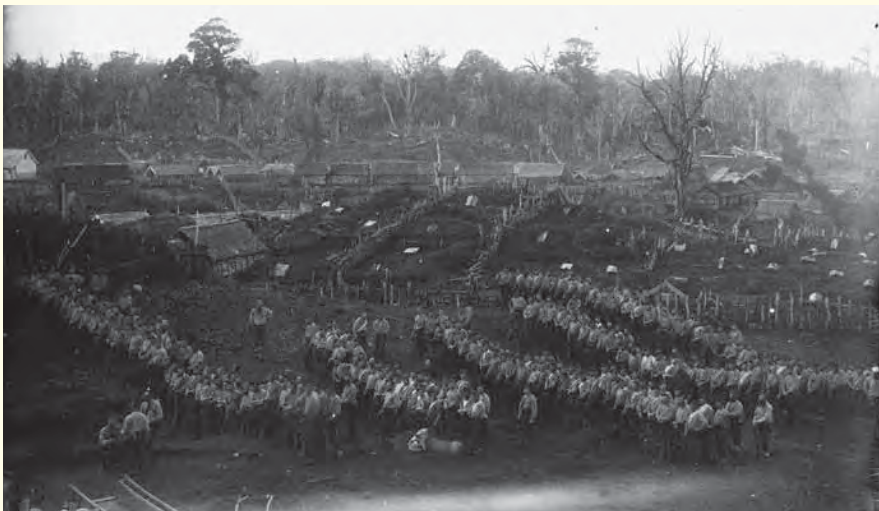
Armed constabulary awaiting orders to advance on Parihaka Pā in 1881.

By the turn of the century many Māori were in dire circumstances. Even the Premier, Richard Seddon, publicly admitted his fears that a large landless body of Māori would become “a burden on the State”. Meanwhile, Māori Councils had been set up in 1900 to address self-governance and improve Māori health and sanitation. They had few resources and limited authority to perform the huge tasks they faced. Many failed within a few years, though some struggled on.