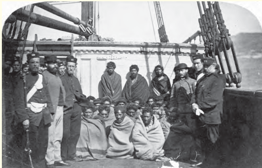
A group of prisoners captured at Weraroa Pa at Waitotara, Taranaki, on a prison ship in Wellington Harbour.

The wars continued until 1872. During this time, settlers’ attitudes towards Māori hardened. Ironically, this was at the same time as the Crown was becoming increasingly dependent on Māori military support. Troop numbers had dropped when many British Imperial troops left under the settler government’s “self-reliant” policy after 1864. The policy was based on the New Zealand ministry (and not the governor) assuming full responsibility for decision-making when it came to Māori affairs. From this point on “the Crown” was in practice the New Zealand government. However, Māori continued to look to the Queen and the British Parliament for their promised protection.