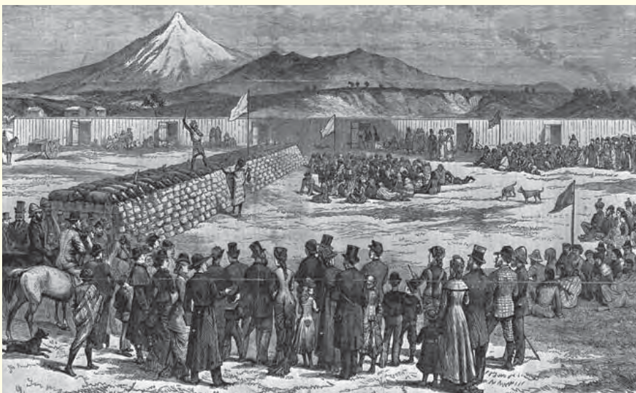
"Meeting of natives with the British authorities at Waitara". Appeared in Harper's Weekly (New York) in 1878.

In 1859 Governor Browne agreed to purchase land at Waitara against the express wishes of superior chief Wiremu Kingi Te Rangitake and other claimants. When Browne ordered the army to support the survey of the block in March 1860, armed conflict broke out, and continued over the next year. Governor Grey later admitted the Crown had been at fault, and returned the block to its owners.