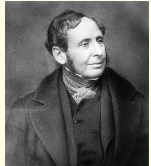
Robert FitzRoy, circa 1850.

In 1844 a parliamentary committee declared the Treaty “injudicious” and proposed a tax on all “uncultivated” Māori lands. Confiscation would be the penalty for non-payment. In 1846 such ideas were reflected in a new constitution and charter for the colony. The governor was to assume ownership of large areas of Māori land not occupied according to Pākehā norms. Missionaries had pointed out that a different standard of “occupation”, defined as the cultivation of crops, was being applied to Māori, than to landowners in England.