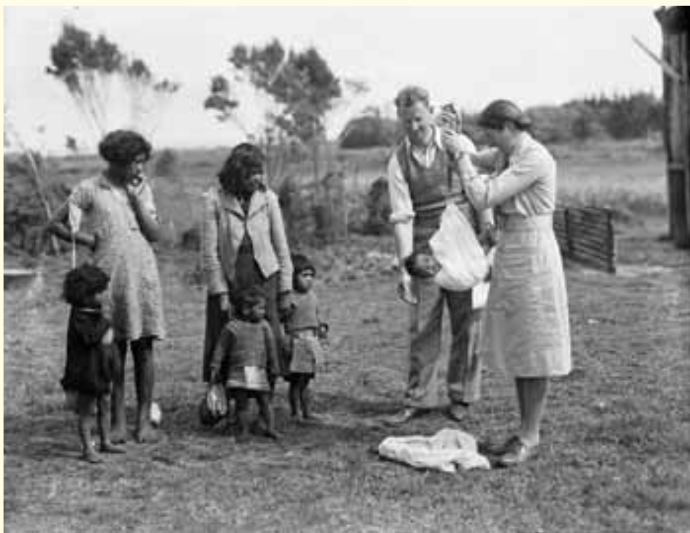
District nurse weighing a baby, Waihara gumfields, Northland, in the 1940s. In 1945 communicable diseases (such as typhoid, tuberculosis, influenza, measles and bronchitis) caused 50 per cent of Maori deaths, compared to only 12-13 per cent of Pākehā deaths. ATL: F-6308-1/1.

been of growing historical significance to many Pākehā, but the gap between the worthy sentiments expressed in the Treaty document and the actual experience of many Māori tribes in the 100 years since its signing remained a sore point for some Māori leaders.