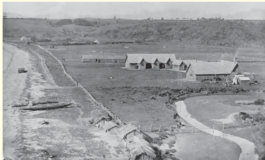
The site of the Kohimārama conference, the Melanesian Mission buildings at Mission Bay, Auckland, 1860. Two waka and a group of whare are visible in the foreground

Instead Grey proposed that Māori districts would be administered through runanga (tribal assemblies), supervised by the Crown. The move was based on the 1858 legislation giving Māori a greater role in their affairs. The "New Institutions", as the runanga were dubbed, were reasonably successful in some more settled areas. However, they could do little to overcome huge distrust of the Crown in many disaffected Māori communities.