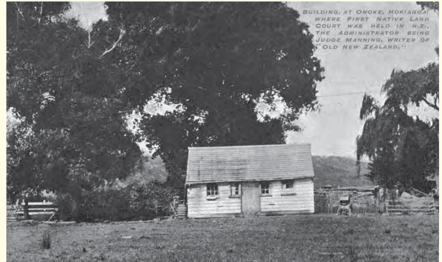
Judge F.E. Manning’s courthouse, the first Native Land Court, Onoke, Hokianga.

Complex Māori customs relating to land ownership and succession were ignored by the court in favour of a simplified set of rules. There was little recognition of tribal variations in custom, or of the way in which resource rights to the same lands could be spread among several different groups. This often increased tensions among tribes appearing in court, forcing them to compete for exclusive rights to lands they might once have shared.