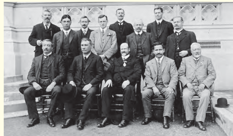
Māori MPs in the early 1900s: middle row left, Peter Buck (Te Rangi Hiroa); front row, second from left, James Carroll; second from right Apirana Ngata; far right, Tame Haereroa Parata. Sitting as part of the Native Lands Committee.

It has been suggested by some historians that the schools actually defeated their official purpose of assimilating Māori into Pākehā society. Certainly after 1867 many notable Māori leaders who promoted the survival of Māori culture received their education through this system.